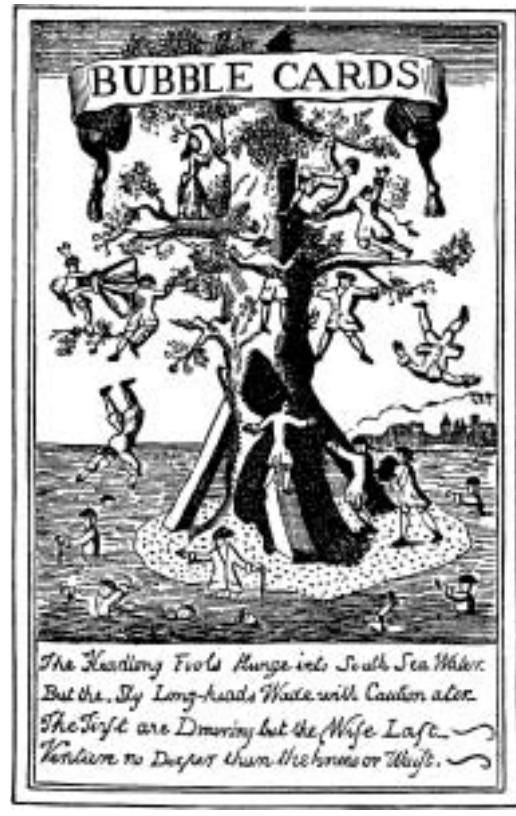
Tree caricature from South Sea Bubble cards. Scanned from reprint of 1841/1852 editions of "Extraordinary Popular Delusions and the Madness of Crowds."

Thousands of people were ruined and the Bank of England, itself a large purchaser of shares, was on the brink of bankruptcy. Crisis was averted by a transfusion of Rothschild cash delivered from France.