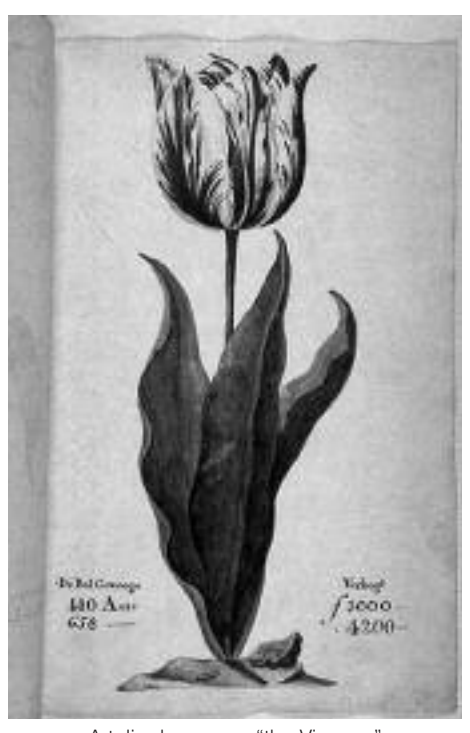
A tulip, known as "the Viceroy," displayed in a 1637 Dutch catalog.

Tulips were first introduced into Holland from Turkey in the 15th century. Growing conditions in Holland turned out to be excellent