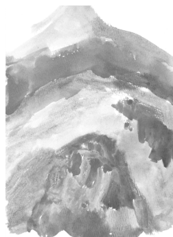
Drawing in bright pinks and oranges

'Notes upon a Case of Obsessional Neurosis'